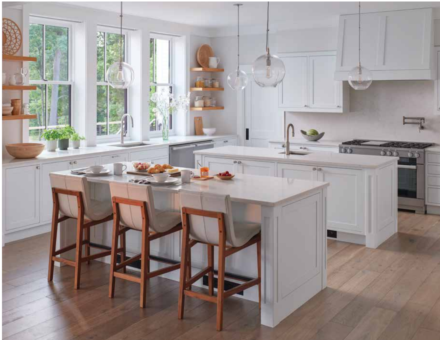
ABOVE: The kitchen has a calming clean white palette. Double islands allow for plenty of room to work and congregate. FACING PAGE: The fireplace in the primary bedroom is finished with wood paneling rather than stone. “It felt warmer,” says Layman, “and was a blend of the couple’s competing preference for modern and traditional decor.” The artwork above the fireplace is by Julia Purinton, while the art on the right is by Jim Westphalen.