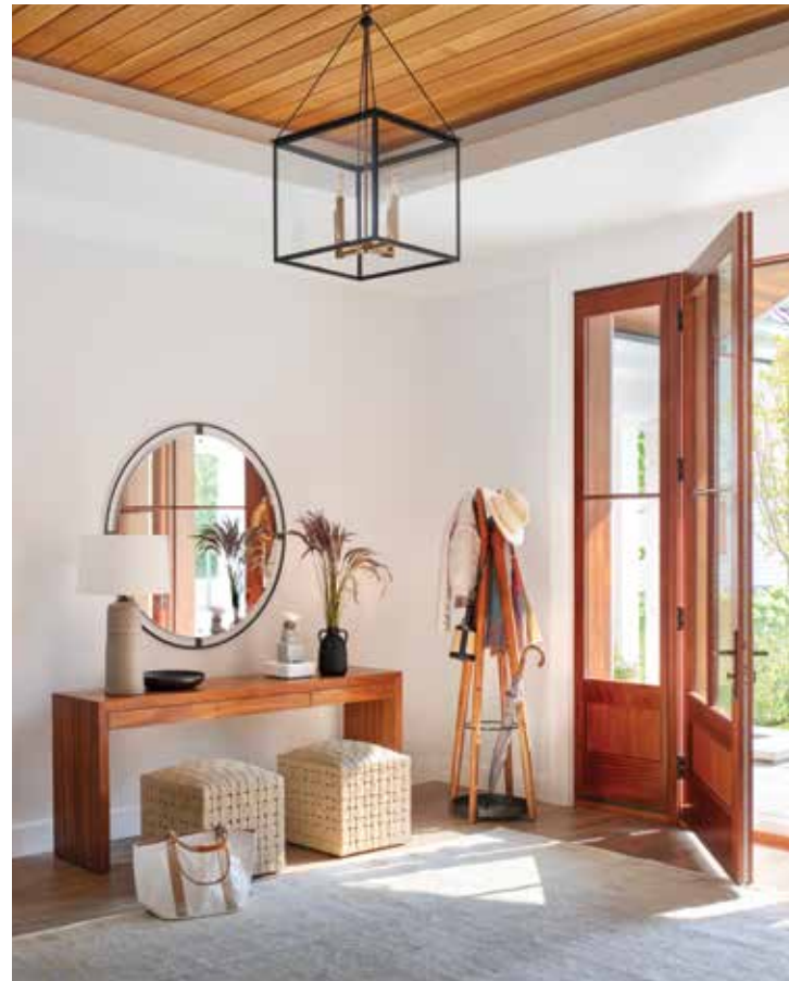
ABOVE: A tongue-in-groove white-oak ceiling in the entry hall continues a design through line that begins on the porch ceiling and is found elsewhere in the house. RIGHT: The white-oak ceiling adds warmth to the solarium, which Newschool Builders’ Patrick McHugh describes as “the most beautiful room in the house.” The furnishings are simple and light, keeping the emphasis on the view.

At 11,893 square feet, the central structure is a modern take on Hubka’s nineteenth-century farmhouse with an L-shaped footprint that supports