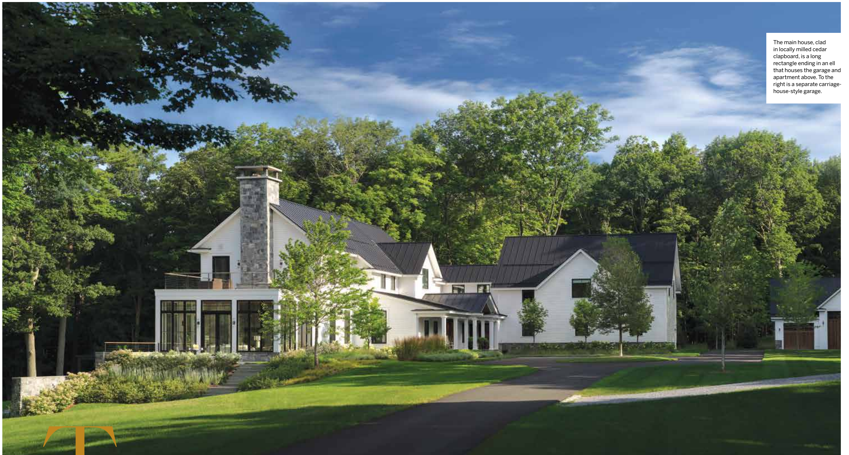
The main house, clad in locally milled cedar clapboard, is a long rectangle ending in an ell that houses the garage and apartment above. To the right is a separate carriage-house-style garage.

The classic New England farmhouse is so—New England. A stereotypical observation? Perhaps, but one that highlights the positive. Consider the form's admirable straightforward